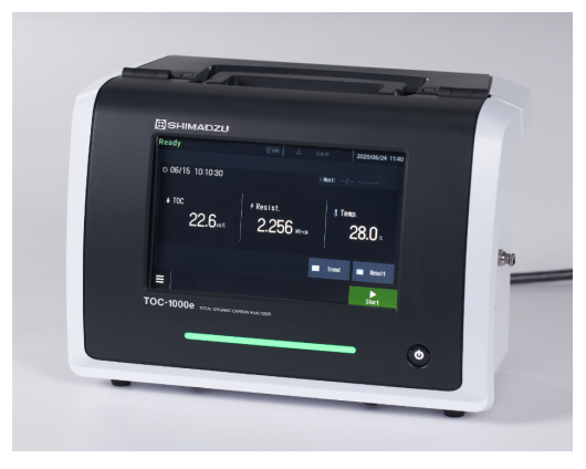
Fig. 1 TOC-1000e