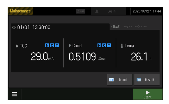
Fig. 2 Color Touch Panel Screen on TOC-1000e