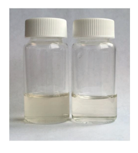
Figure 1. Sample: whole blood following zinc sulfate precipitation and centrifugation. Left vial unfiltered; right vial filtered using ISOLUTE* FILTER+ plate.

ISOLUTE FILTER+ plates contain a 25 \mu m depth filter stacked above a 0.2 \mu m wettable membrane. This allows samples with high particulate levels to be filtered efficiently, without blocking. Final sample is suitable for direct injection into UPLC-MS/MS systems.