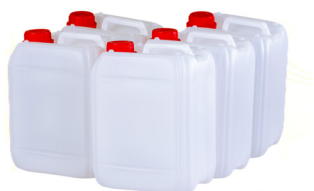
Reservoir 5 L, GL45

Biotage provides pre-calibrated Biotage reservoirs for a true plug and play experience.