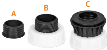
Figure 2. A: Universal Cap Adapter. B: The cap with the 38 mm hole on top of the adapter. C: The 38-430 cap attached to the adapter and the modified cap.