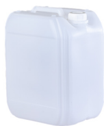
Reservoir 10 L, GL45