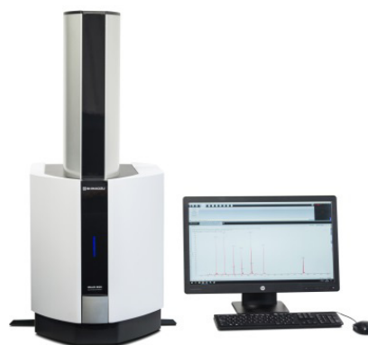
Fig. 1 MALDI-8020 benchtop linear MALDI-TOF instrument